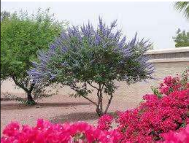
44 Chaste Tree Monks Pepper