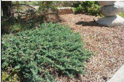
26 Juniper Blue Rug-slope