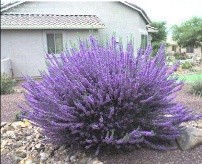
36 Texas Ranger Rio Bravo