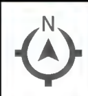
Figure 2: Vicinity Exhibit