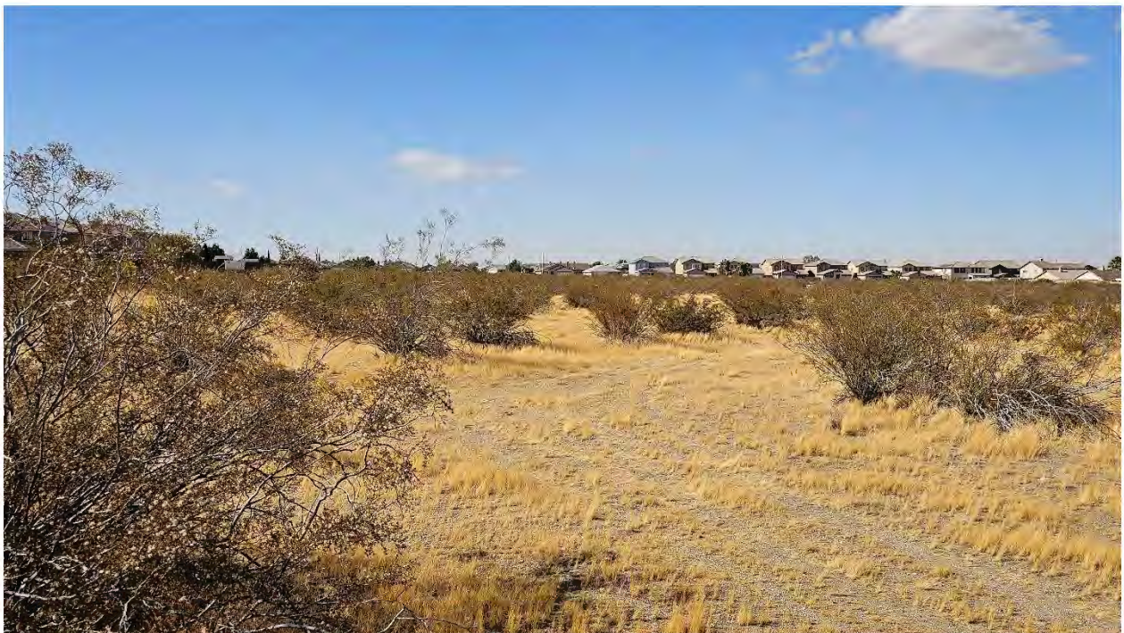
FIGURE 3, cont: PHOTOGRAPHS OF SITE