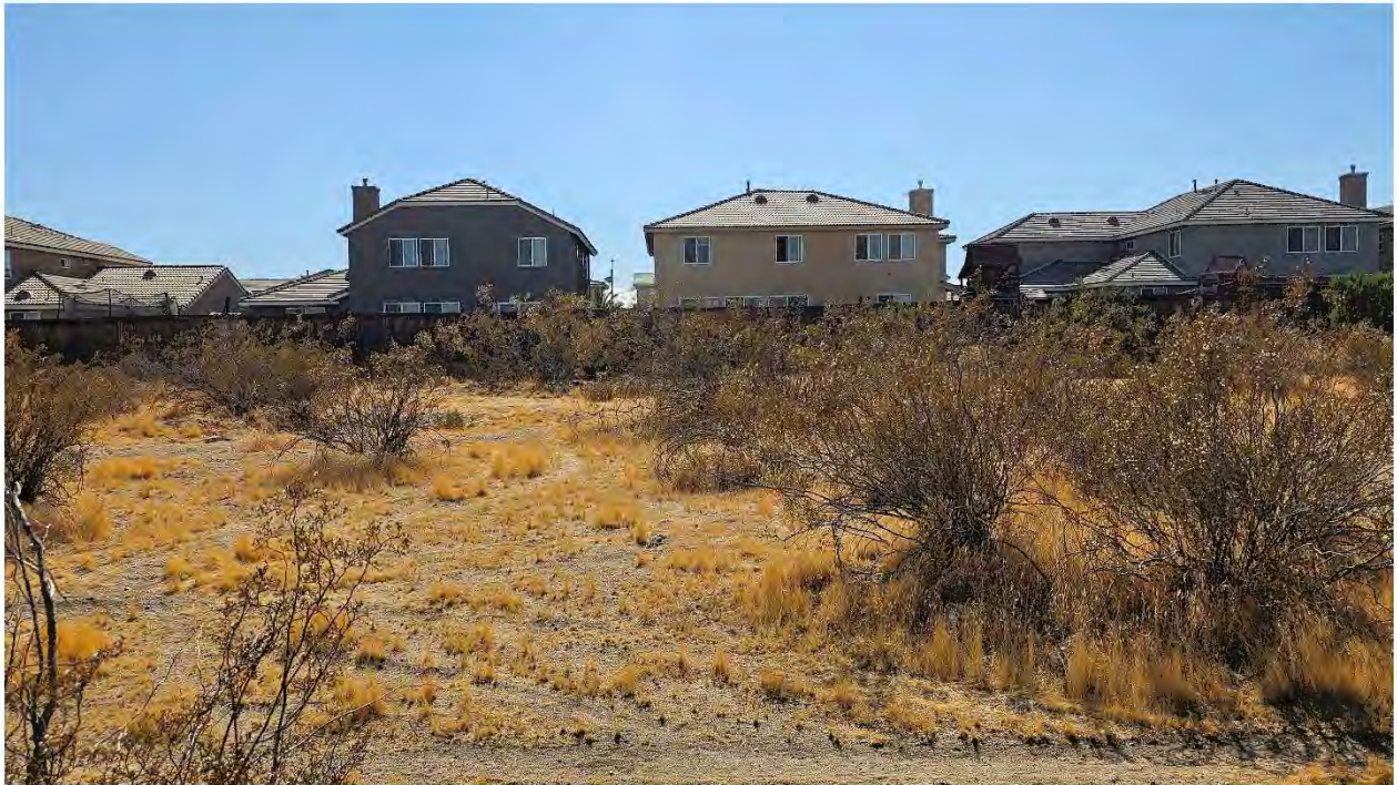
CENTER OF SITE LOOKING WEST