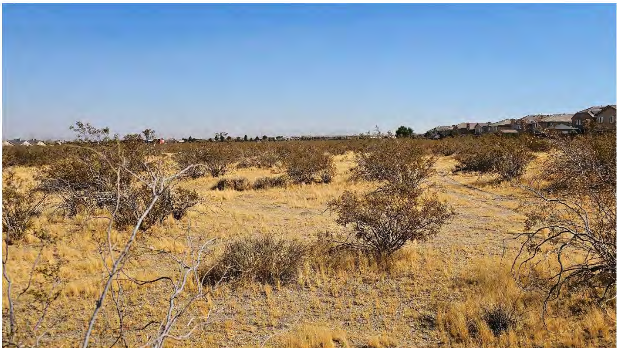
FIGURE 3: PHOTOGRAPHS OF SITE