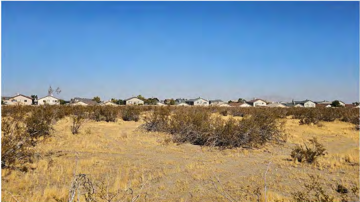
CENTER OF SITE LOOKING EAST