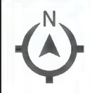
Figure 1: Regional Exhibit Produced By: RCA Associates, Inc.

NW of Bella Pine St. and Forrest Park Ln. in Victorville, CA.